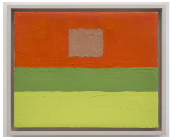
Etel Adnan, "Untitled," 2012. Oil on canvas, 8 × 10".

Roffino: For both of you, your publishing work is very morally driven, politically driven, but your other work isn't necessarily. Your painting, Etel, is so joyful and so light, and, Simone, your sculpture seems not directly political. For some people the act of making something beautiful is political—it is a radical, political thing to do. Do you address the political within your work that isn't directly political?