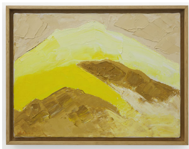
Etel Adnan, "Untitled," circa 2000. Oil on canvas, 9 × 12". Courtesy the artist and

Etel Adnan: You want to start there. That's good. I was 20. Before that we didn't read French poetry at all or any other poetry, maybe very little in elementary school. So it was my first college year in Beirut, and it